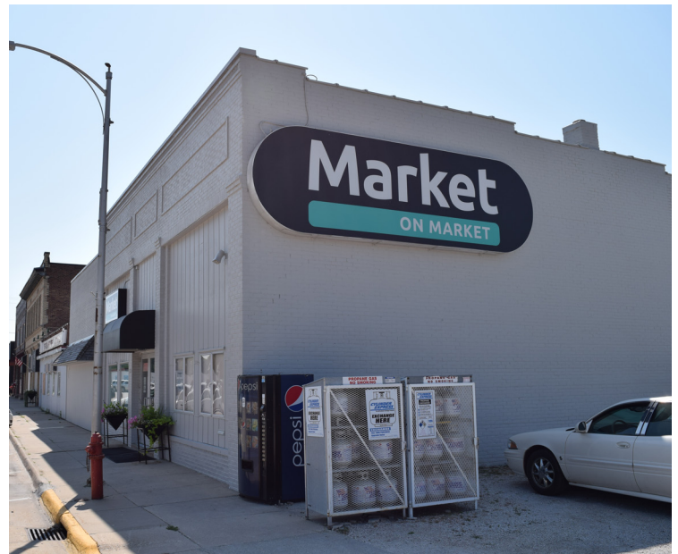
The storefront of Market on Market. The name of the store was chosen through a community vote.