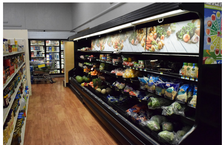
Fresh produce aisle in Market on Market.

When creating a board, it is important to consider the different skills people in town can bring to the table. For example, Market on Market's board members have diverse backgrounds and expertise in banking, construction, farming, and economic development – all of which helps the store in various ways.